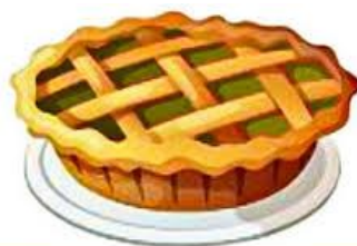
Pie Baking Contest